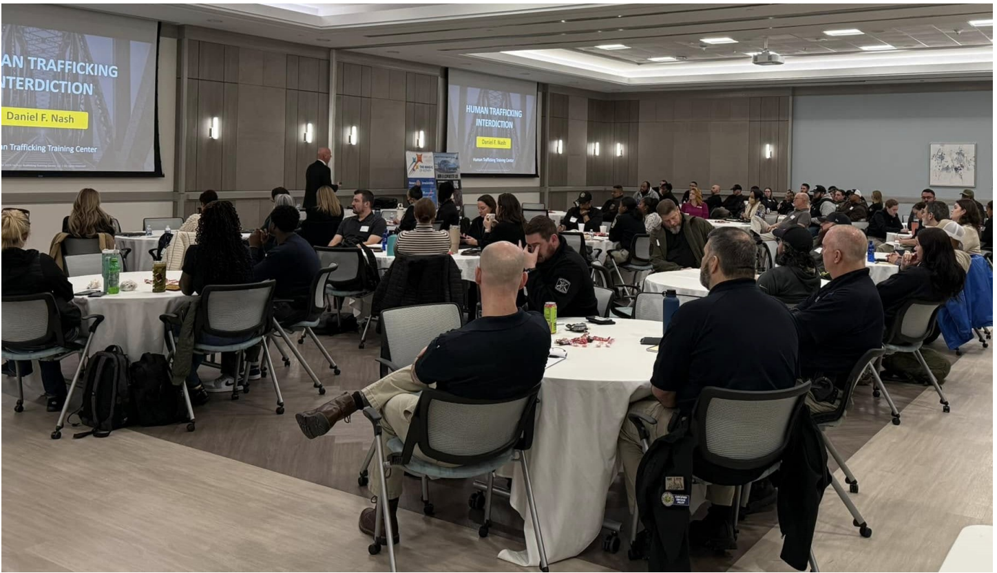
Posted by Mandy Timmons March 2, 2025