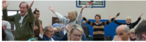
Dancing to Get the Meeting Started