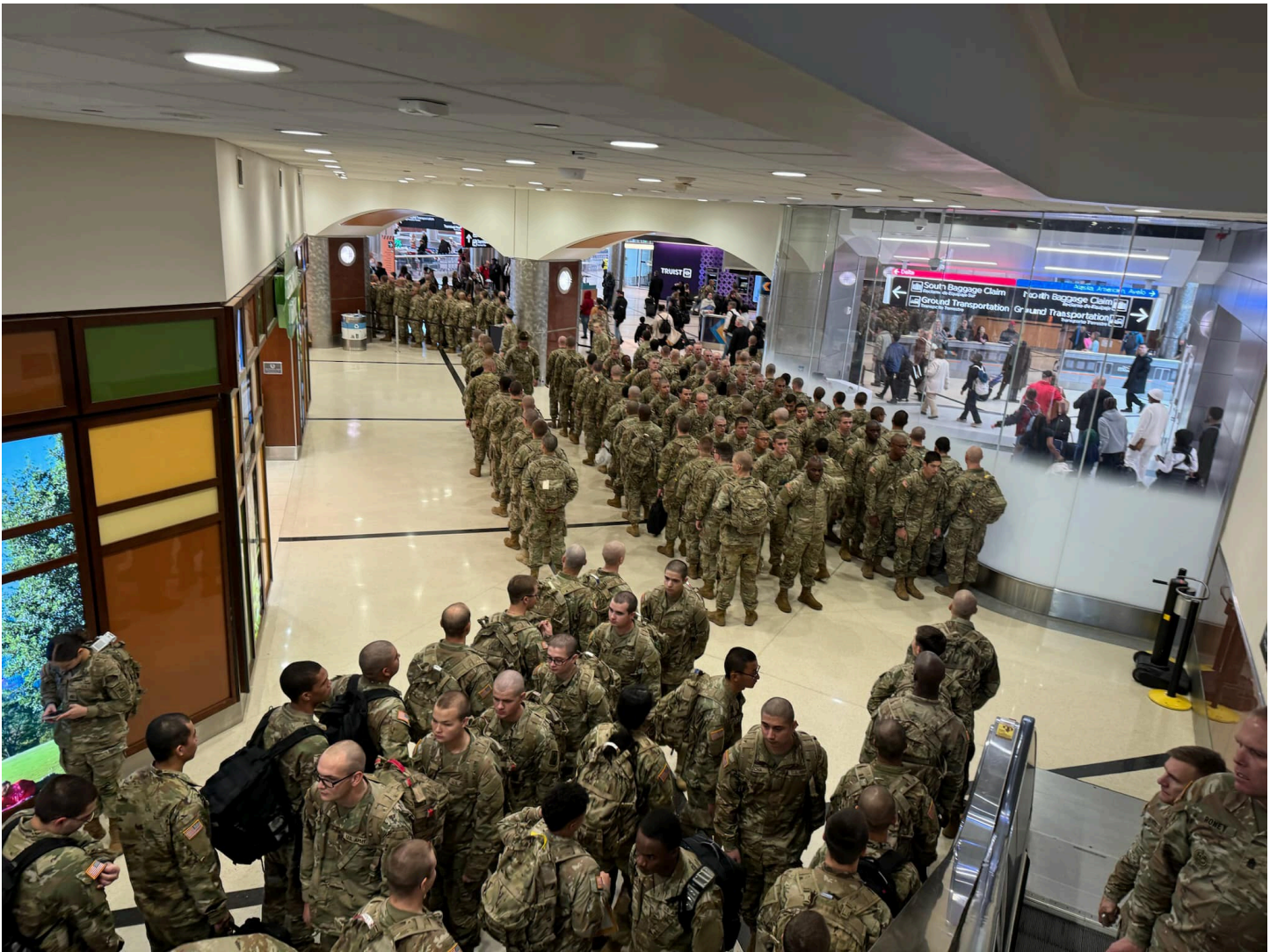
Posted by Roy Strickland April 2, 2025