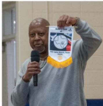
Go New Members!!!